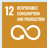
SDG 12: 負責任消費和生產