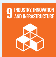
SDG 9: 產業、創新和基礎設施

In recognition of the outstanding contributions to the development and innovation of the electronics manufacturing industry, AMT was awarded the 17 th EM Innovation Awards 2022 with its newly developed machine. This contributes to the SDG 9: Industry, Innovation and Infrastructure.