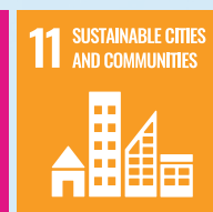
SDG 11: 可持續城市和社區