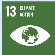
SDG 13: 氣候行動

As more stakeholders are concerned about climate-related issues and the impact of those issues to our operation, we further make our efforts in improving our practices and disclosure on ESG and climate-related issues. The Group made reference to the TCFD recommendations on identifying and disclosing the potential impacts of climate-related risks and opportunities on the business and aligns with SDG 13.