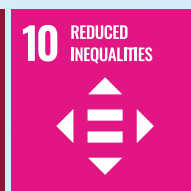
SDG 10: 減少不平等