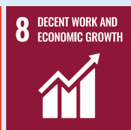
SDG 8: 體面工作和經濟增長