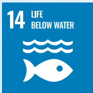
SDG 14: 水下生物