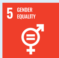
SDG 5: 性別平等

這些政策有助於實現以性別平等為目標的可持續發展目標5、保護勞工權利的可持續發展目標8、減少不平等的可持續發展目標10和促進包容性社區的可持續發展目標11。