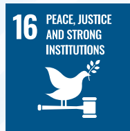
SDG 16: 和平、正義與強大機構

The Group is committed to upholding a high standard of business ethics and to prohibition of bribery and corruption, which is a key component of the SDG 16: Peace, Justice and Strong Institutions.