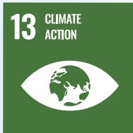
SDG 13: 氣候行動